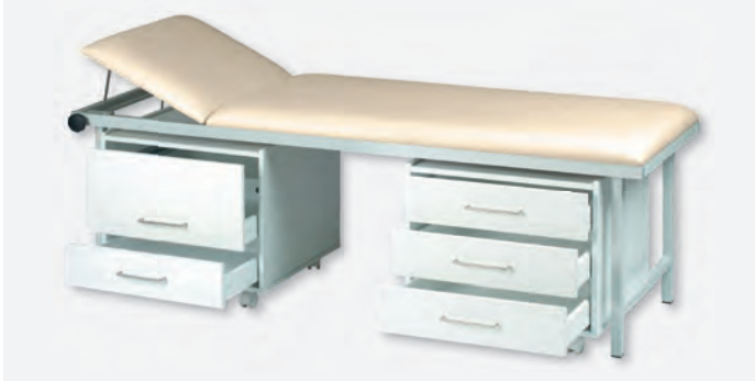
1 SW-470/2, SW-470/3, U-1065

The drawer units, mobile drawer units and multi-purpose mobile cart offer versatile, mobile storage for supplies and equipment. The body of the units and the drawer fronts are made of white melamine-coated panels, thickness 16 mm.