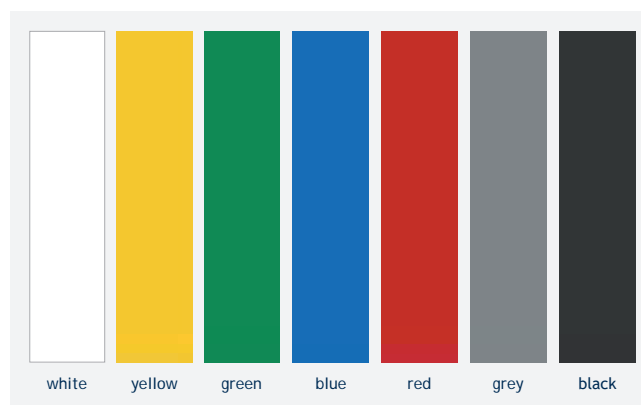
5 Colour options for privacy screen panels